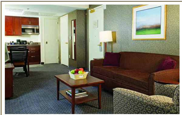
HOSPITALITY SUITE Gather with friends before and after